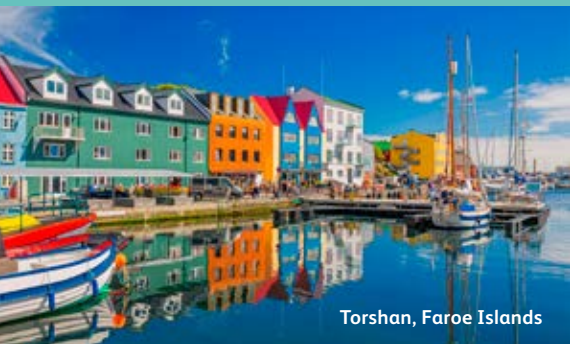
Torshan, Faroe Islands

Its largely uninhabited landscape is a fascinating patchwork quilt of lush valleys, vast ice caps, breath-taking active volcanoes, lively geysers, bubbling mud pools and hot springs, whilst its capital Reykjavik is both charmingly quaint and remarkably cosmopolitan. Along the way, you will enjoy two visits to the equally remote – and equally absorbing – Faroe Islands, with their unique Viking culture and stunning land and seascapes.