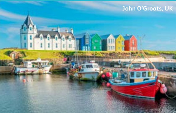
John O'Groats, UK

After visiting the historic port of Falmouth, the quintessentially French town of Honfleur and vibrant Newcastle, we'll head north to Portree in Skye, set amid surreal craggy peaks, and Tobermory in Mull, famous for its pretty pastel houses, before taking in Belfast - a city with a proud maritime heritage and an exciting future.